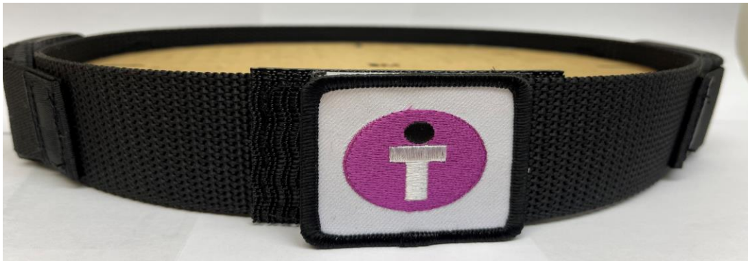
Embroidered purple, black and white Safe Toddles belt logo