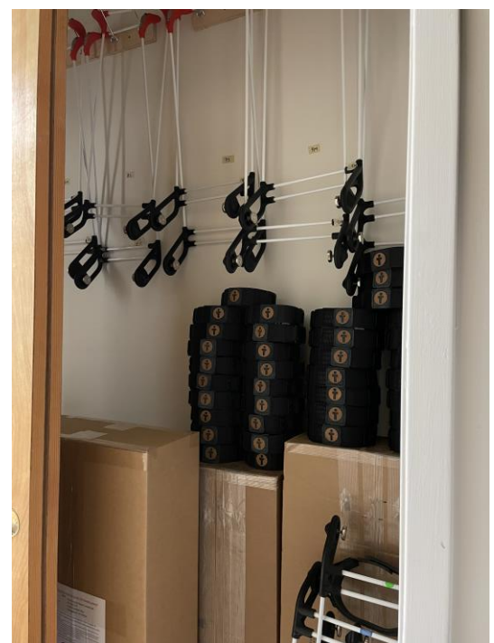
One of several closets containing ready-to-ship stock.

We are also updating the logo on the belt to a colorful purple and white embroidered patch. This reduces the number of materials needed to produce the pediatric belt cane belt and looks great too.