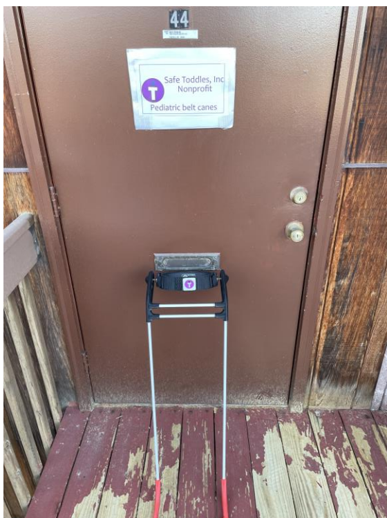
The front door of Safe Toddles

We have moved our operations. All Safe Toddles operations are now housed in one location. The benefit of being under one roof is we have improved wait times, a cane ordered before three PM, is shipped the same day. We have hired staff to assist in customer service, belt cane manufacturing and outreach.